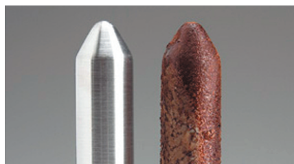
PURITY FG Specialty Chemical Company

Unlike a leading chemical company's fluid, PURITY FG Trolley Fluid passes the demanding ASTM rust test (Sequence A & B). This strong level of corrosion protection can extend equipment life in the wettest operating conditions while protecting food products from rust contact.